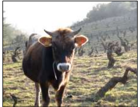
A farmer's best employee. This cow is helping weed the organic vineyards in Corbières Southern France.